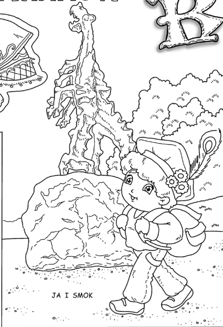
JA I SMOK